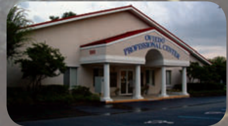
OVIEDO MEDICAL PLAZA -- OVIEDO, FL 10,000 SQ. FT. DESCRIPTION: FACILITIES WORK; SELECTIVE REMODELS