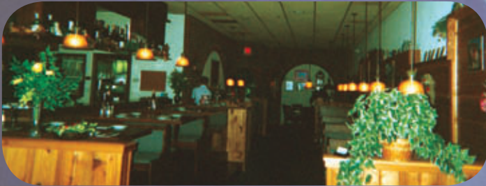
MATTHEW'S STEAK AND MORE -- OCOEE, FL 1,800 SQ. FT. $98,000 DESCRIPTION: GERMAN LEITMOTIF TENANT IMPROVEMENT WITH WOOD-BURNING GRILL