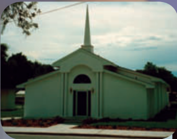
FAITH CHAPEL ASSEMBLY OF GOD -- LEESBURG, FL 5,000 SQ. FT. $60,000 DESCRIPTION: COMPLETE REMODEL WITH ADDITIONAL TRUSS PACKAGE TO ACCOMMODATE MODERNIZED REST ROOM FACILITIES

D etail-minded and diligent in every respect, Mr. Warmoth puts as much care and consideration in working on a sole proprietor's tenant improvement project as when remodeling a congregation's place of worship; as when converting a structure into a national client's multi-million-dollar restaurant.