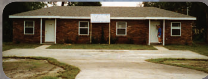
FELMAN APARTMENTS -- EAST ORLANDO, FL 1,236 SQ. FT. $82,000 DESCRIPTION: GROUND-UP RESIDENTIAL DUPLEX OTHER FELMAN PROJECTS: *EAST ORANGE COUNTY, FL: $102,000 DUPLEX *UCF AREA, ORLANDO, FL: $80,000 DUPLEX *WINTER PARK, FL: $80,000 DUPLEX

Detail-minded and diligent, this builder maintains a full grasp on the job-site situation, regardless of the scope of the project.